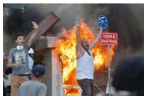
ISTANBUL, TURKEY: Riot police over run protester's barricades