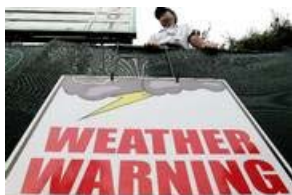
U.S. OPEN: Day one begins with weather warning