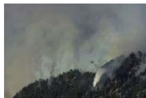
HATHAWAY FIRE: Blaze burns 1,650 acres